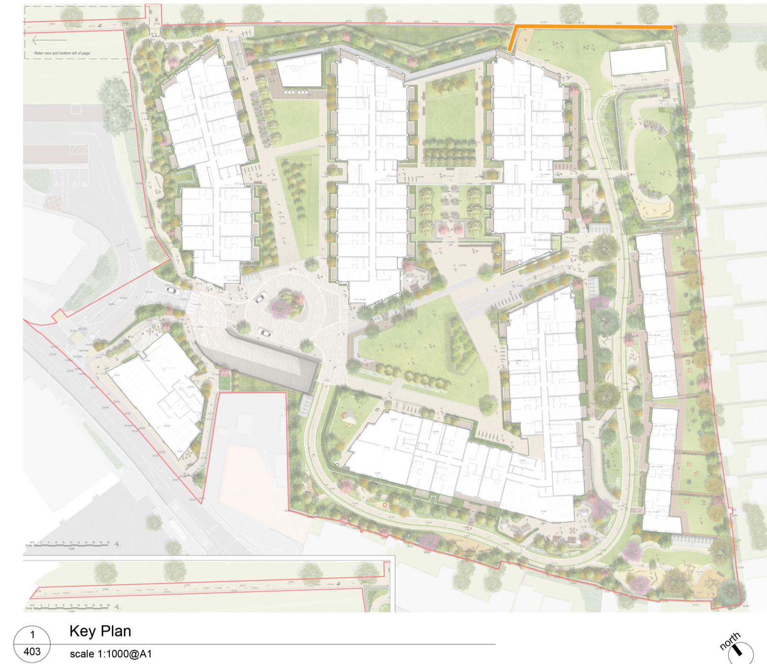
1 Key Plan 403 scale 1:1000@A1

DISCLAIMER 1. This drawing is the property of Cameo & Partners Ltd. 2. It must not be copied or reproduced without written consent. 3. No dimensions to be scaled from this drawing. 4. All dimensions to be checked on site. 5. This drawing is to be read in conjunction with relevant consultants drawings.