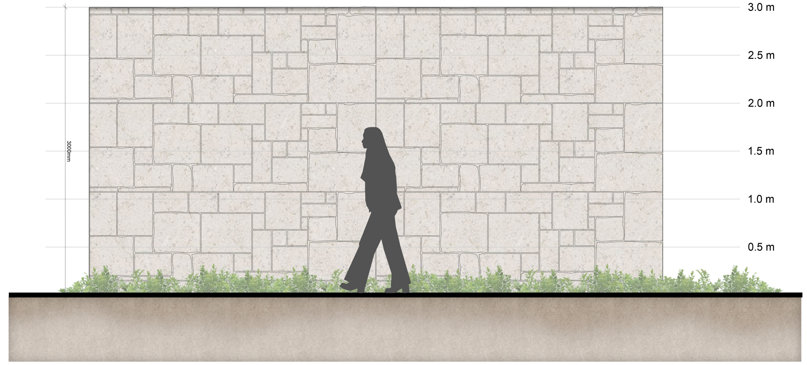
3 BT3- Rubble stone wall with a height of 3m - Elevation 403 scale 1:20@A1